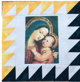
Our Lady of Good Counsel

The quilt is made up of twelve blocks, each block depicts a Woman Saint who made a mark on the Catholic World. The councils that have signed up to help make the quilt were given a chosen Saint, with a quilt pattern and fabric. Our Lady of Good Counsel was the Saint assigned to St Charles. Our assignment was to make the quilt block and write a very short story about her. The finished quilt will be presented at the Diocesan Convention in Red Deer in April.